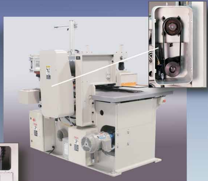
The machine's back side is shown with the arbor drive housing cover removed to depict the automatic arbor brake.

Arbor Motor 10 HP (7.5 Kw), 15 HP (11.2 Kw) optional