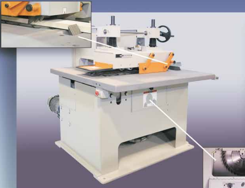
The front view illustrates access into the electrically interlocked saw pit area, the dual anti-kickback finger system and the pivoting pressure beam side guard.

pressure roll system make up the foundation for this saw that produces the industry's most accurate glue line cut, guaranteed. The Diehl SL-30 is the rip saw that you can depend on for continuous quality performance.