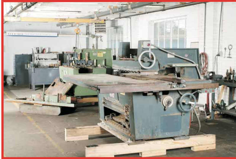
▲ A Diehl SL-52 Straight Line Rip Saw returned to the factory after years of hard production use. Positioned in-line and ready for remanufacturing.

Insist on a genuine factory remanufactured saw with all the latest safety equipment, technical improvements and one year warranty only available from Diehl Machines.