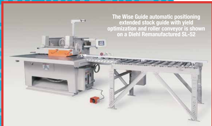
▲ The Wise Guide automatic positioning extended stock guide with yield optimization and roller conveyor is shown on a Diehl Remanufactured SL-52

Insist on a genuine factory remanufactured saw with all the latest safety equipment, technical improvements and one year warranty only available from Diehl Machines.