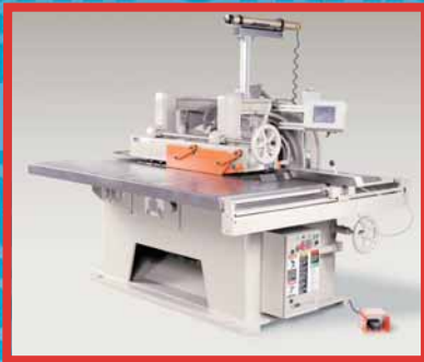
▲ The Wise Guide automatic positioning stock guide with yield optimization is shown on a Remanufactured 750