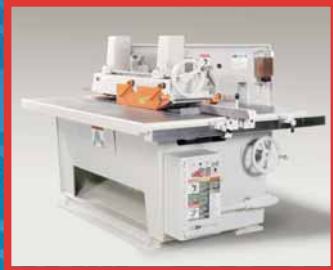
▲ Remanufactured SL-52