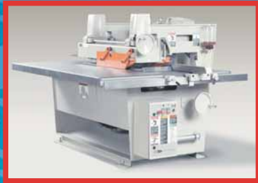
▲ Remanufactured SL-50