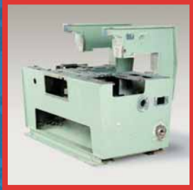
▲ A Diehl rip saw stripped down to the frame ready for remanufacturing