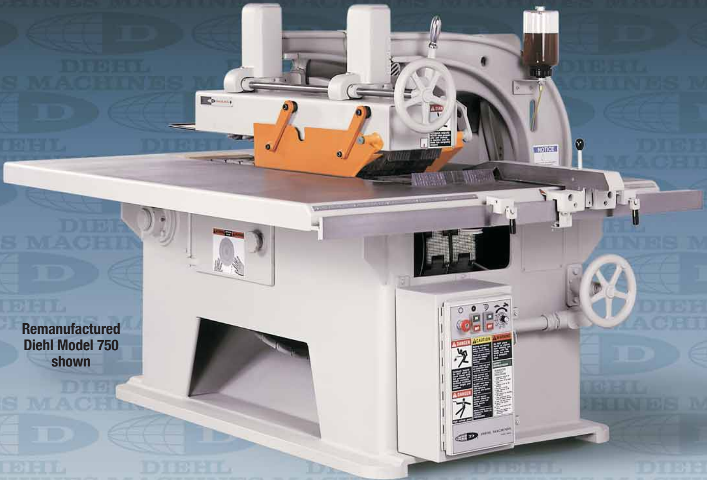
Remanufactured Diehl Model 750 shown

Diehl will buy, take in trade or remanufacture your old rip saw.